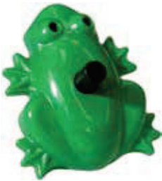
DripPets® Frog 4 lph PC