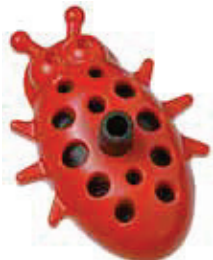
DripPets® Ladybug 4 lph PC