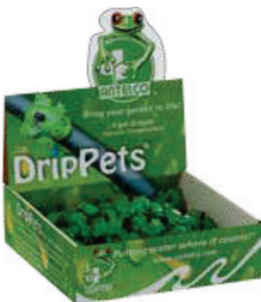
DripPets® Retail Box