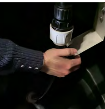
11. Unscrew the KRAL32-1 kit compression fitting and pass the Opal tube through the "ASPIRATION" seal.