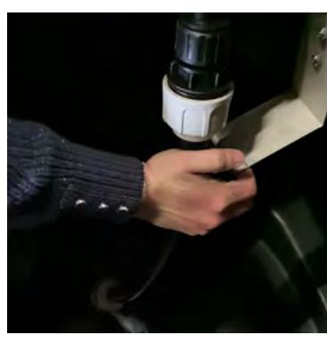
3. Unscrew the compression fitting from the KRAL32-1 kit and pass the Opal tube through the "ASPIRATION" seal. Note: this connection will not be used in this configuration.