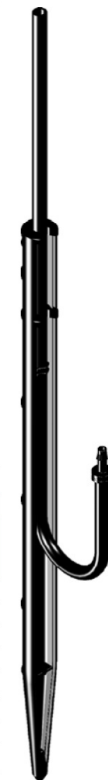
Ultra™ Stake with Rigid Riser & 500 mm FPVC