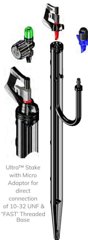
Ultra™ Stake with Micro Adaptor for direct connection of 10-32 UNF & "FAST" Threaded Base