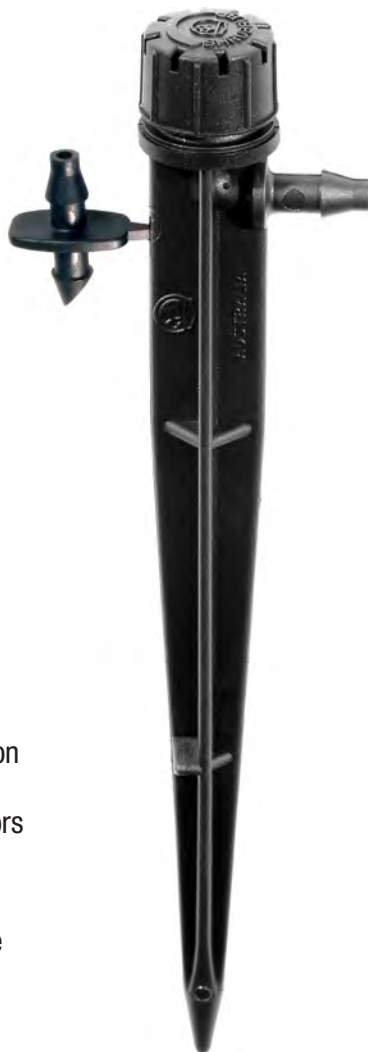
Shrubbler® Spike Inlet 4 mm w/ Break Off Adaptor