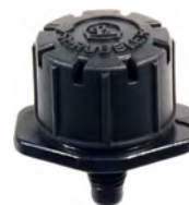
Shrubbler® Thread 4 mm