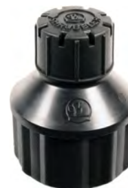
Shrubbler® Thread 1/2" Female