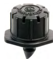
Shrubbler® Barb 4 mm