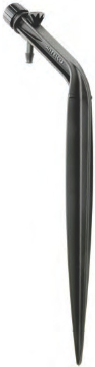
PotStream™ Adjustable Flow