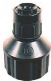
Spectrum™ Thread 1/2" FNPT