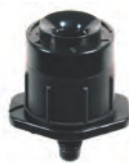
Spectrum™ Thread 4 mm