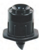
Spectrum™ Barb 4 mm