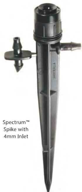
Spectrum™ Spike with 4mm Inlet